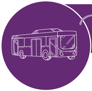
Table 1 - Key recommendations from the Deep Dive with CALD consumers