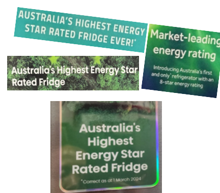
Figure 4. 'Highest' energy star rated claims