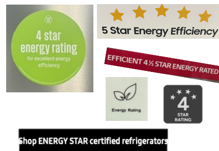
Figure 2. Energy star marketing

However, some were still sceptical due to the feeling of important information being obfuscated.