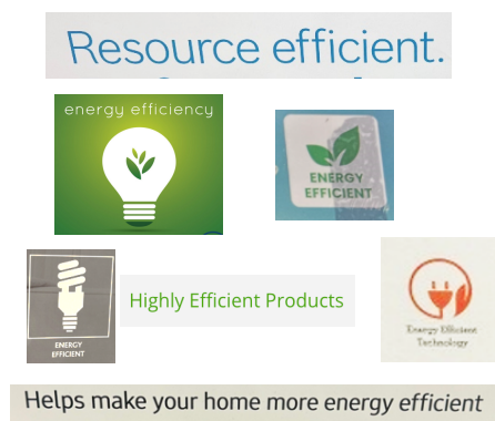
Figure 3. 'Efficiency' claims

Overall, 55% of participants rated claims of "energy / resource efficiency" as important, and 53% rated claims of "highest" / "most" energy efficient as important in a purchase decision.