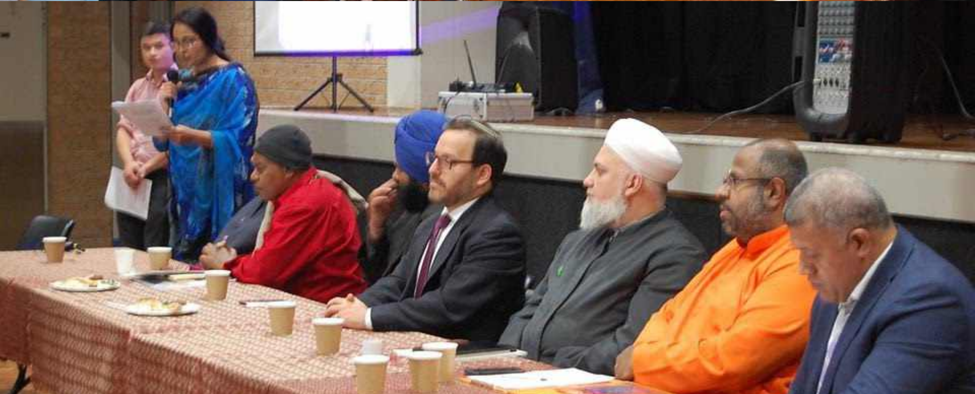
LISTENING: VOICES FOR POWER INTERFAITH TABLE TALK