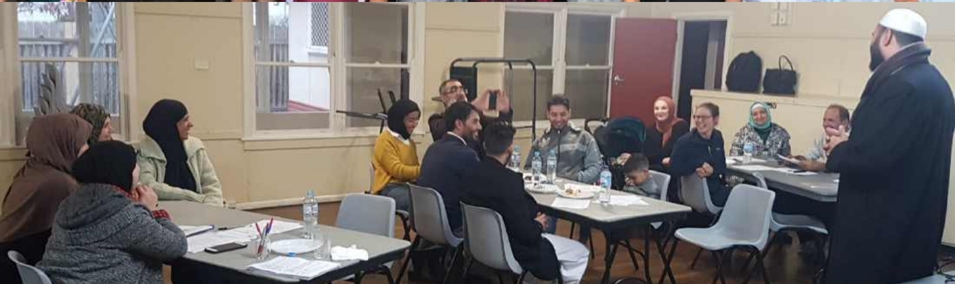
LISTENING: VOICES FOR POWER COMMUNITY TABLE TALKS