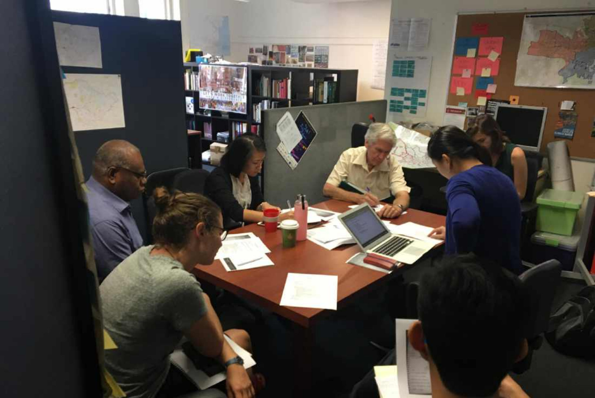
RESEARCH: VOICES FOR POWER LEADERS MEET WITH ENERGY EXPERTS