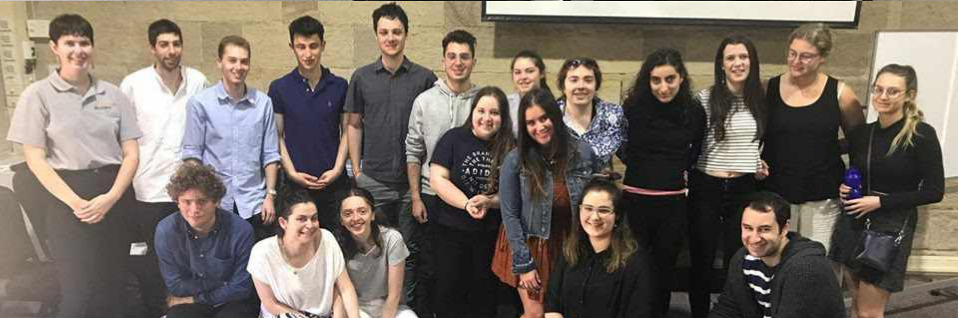
LISTENING: VOICES FOR POWER COMMUNITY TABLE TALKS