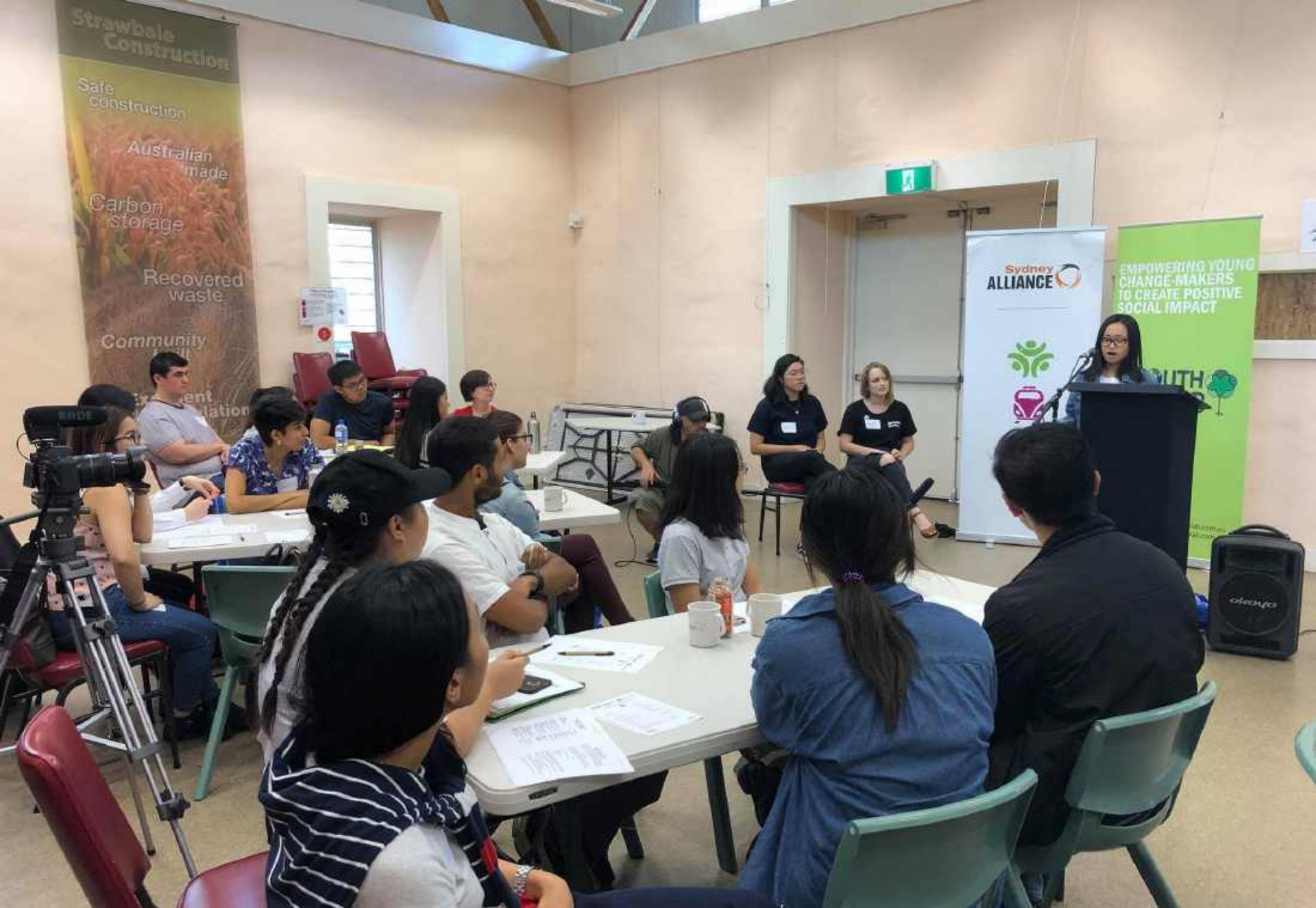
LISTENING: VOICES FOR POWER COMMUNITY TABLE TALKS