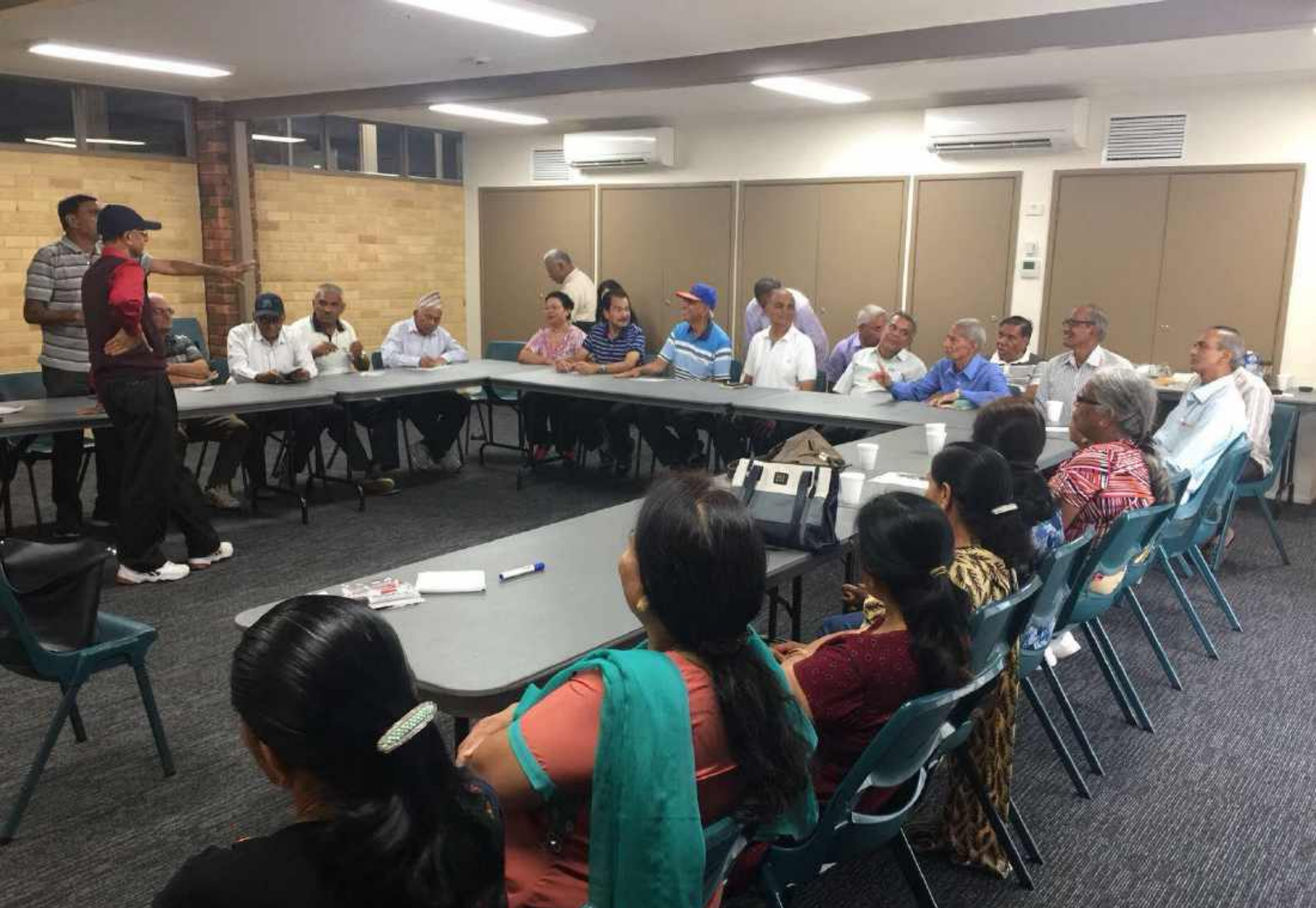
2018 - LISTENING: VOICES FOR POWER COMMUNITY TABLE TALKS