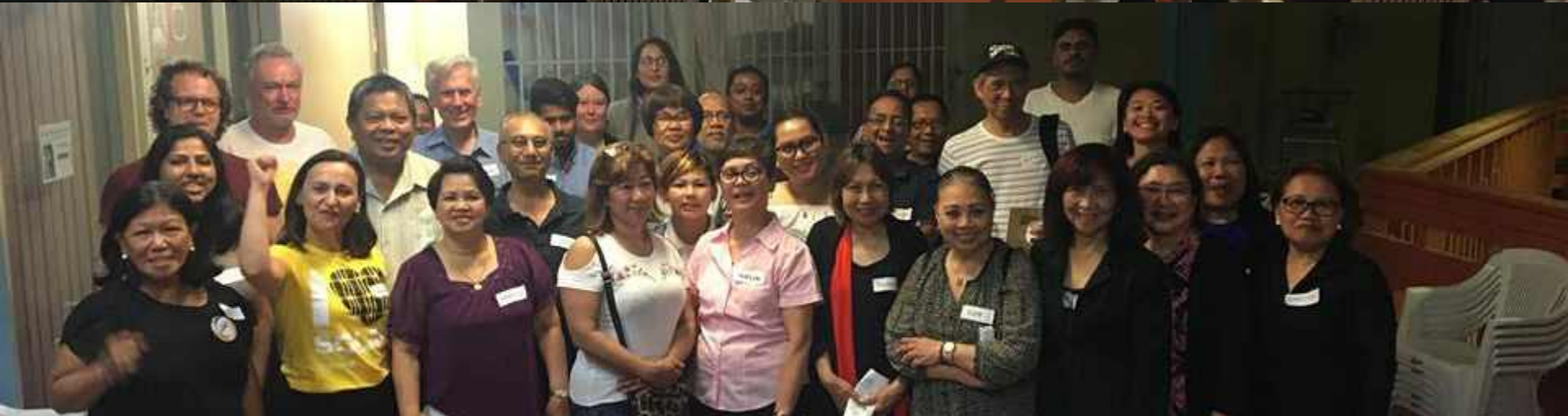
LISTENING: VOICES FOR POWER COMMUNITY TABLE TALKS