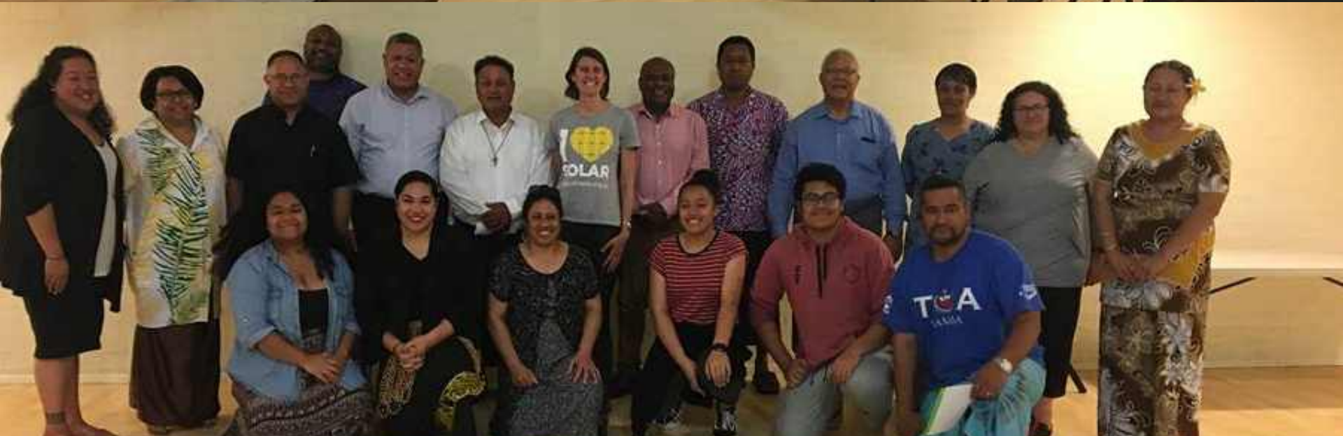
LISTENING: VOICES FOR POWER COMMUNITY TABLE TALKS