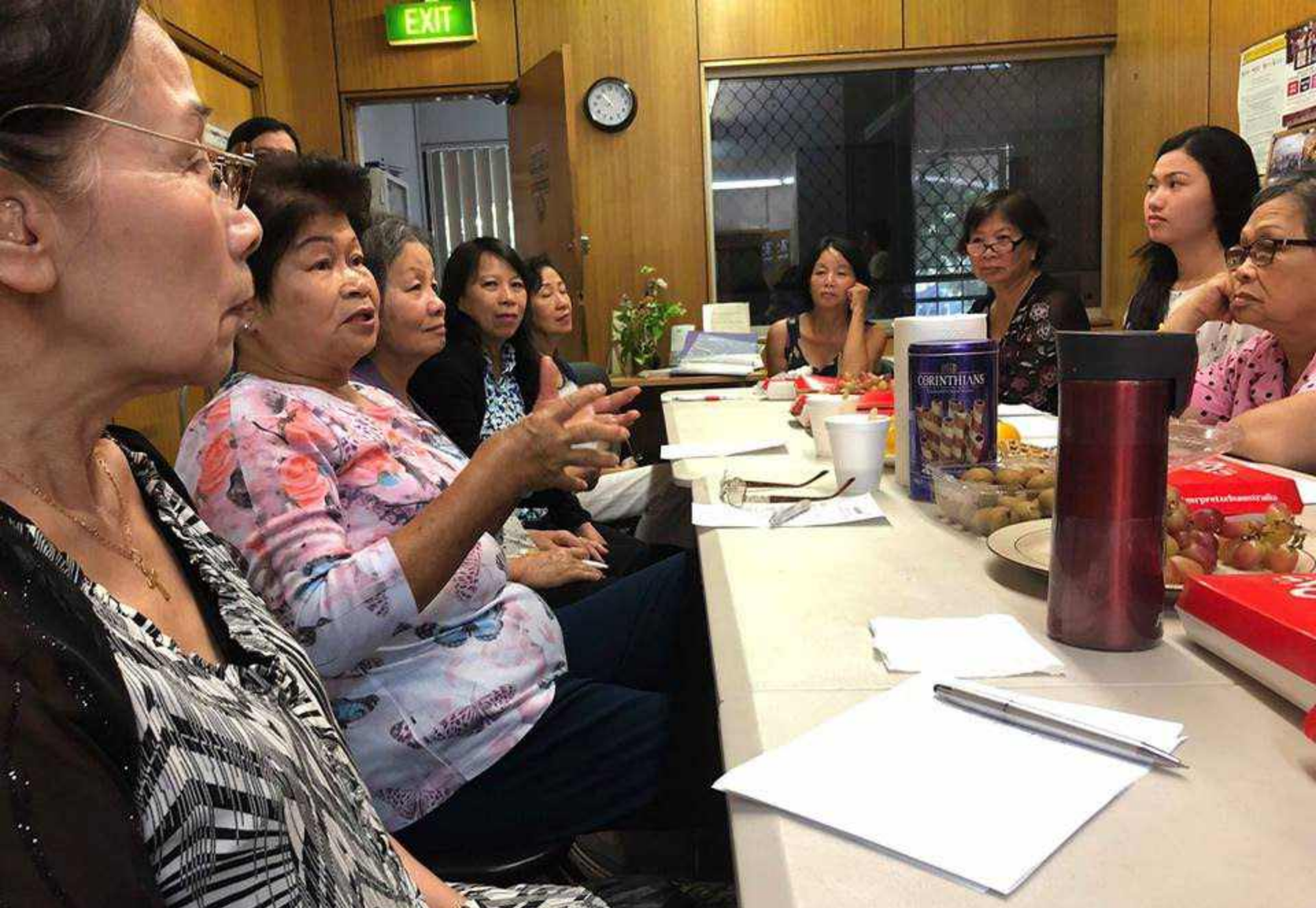
LISTENING: VOICES FOR POWER COMMUNITY TABLE TALKS